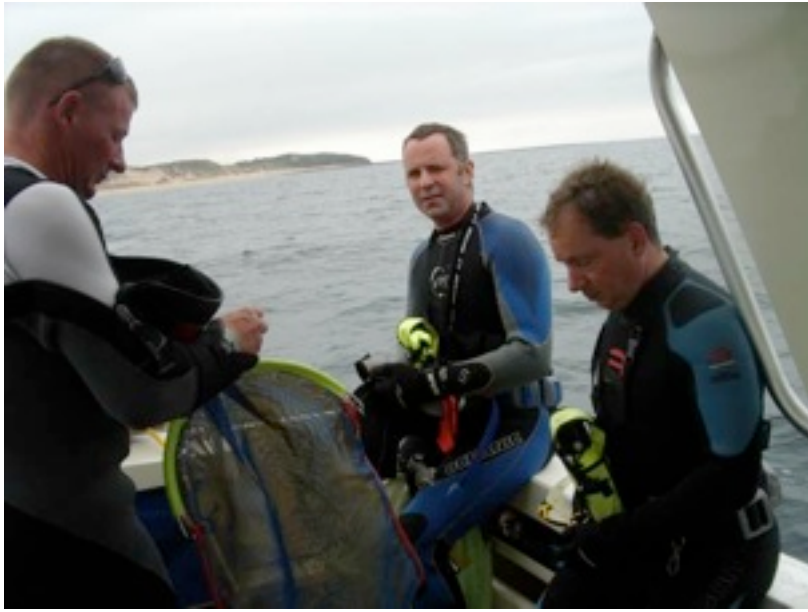
The Callow crew getting ready at Harmers