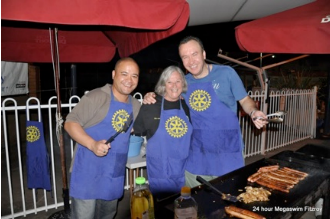
Friendly Rotary People & BBQ

Thanks to all those who supported us this year and the swimmers.